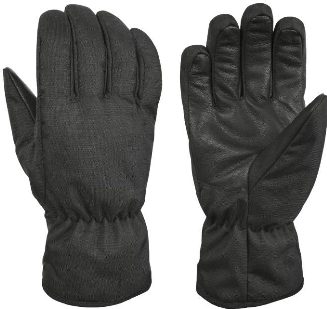
EMILY POLICE Gauntlet Black

Collection of special gloves for police and security services.