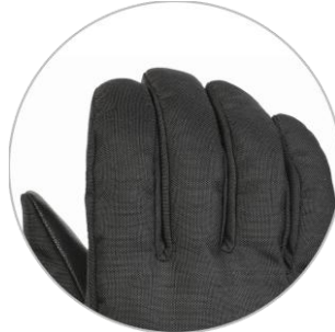
Thermal Insulation: Primaloft®