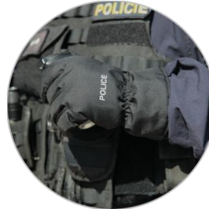
Water, oil and dirt resistant Cordura® finish