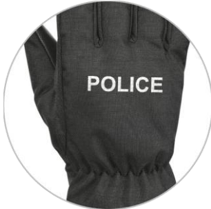
possibility of individual printing